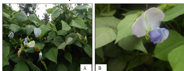
Figure 2. The mature winged bean with unopened (A) and opened flowers (B)

The total number of inflorescence ranged from 41.9-52.8 per plant, irrespective of treatments (Table 2). The flower stalks are green; the flower petals have butterfly shape with light blue wing colors (Figure 2). Winged beans has compound flowers; one inflorescence has 3-8 flower buds which will potentially produce pods. According to Gahara (2015) an Isoflavone Bioactive Compound Characterization and Anti-oxidant Test from Tempe Extract of winged bean has 3-10 flower buds, however, Enderyani (2017) noted that only 3-5 flower buds develop into mature flower while the rest fail to bloom and drop.